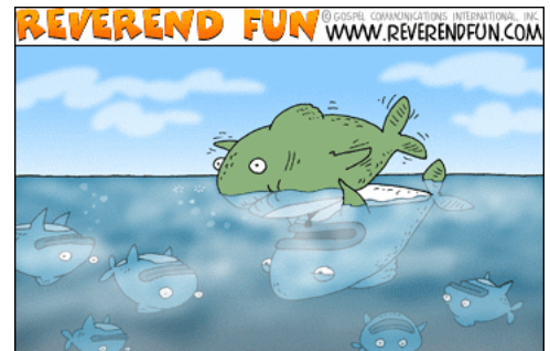
WHEN FISH GET BAPTIZED

We are commanded to "encourage one another daily" (Hebrews 3:13). Do you praise your children daily? Would you be known as "Mr. (or Mrs.) Encouragement"? On the back of this newsletter are some ideas to help you praise your children and to help them learn to encourage others.